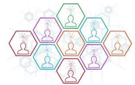
Company's key people

Detecting hidden companies – Looking at patent documents makes it possible to identify companies that do not communicate much or even at all. It is a good way to detect companies that could not be found using more conventional methods (e.g. trade fairs, conferences, web searches, etc.).